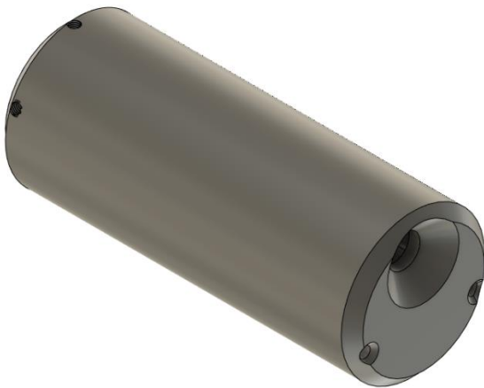
Long Baffle 410